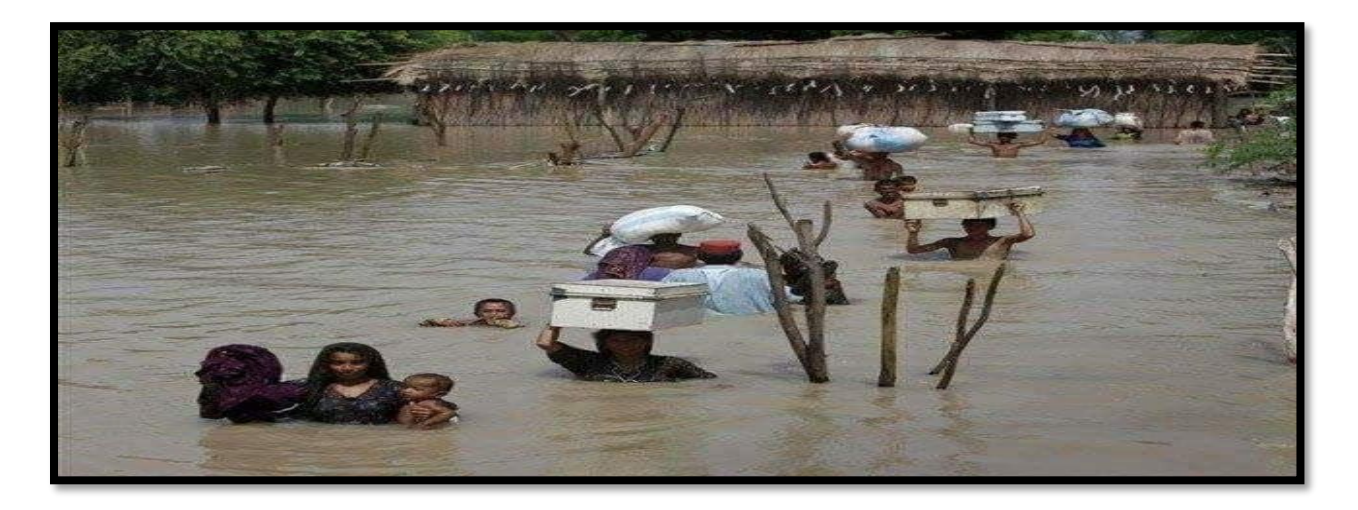
Figure 1 people migrating to camps during the flood in Sindh