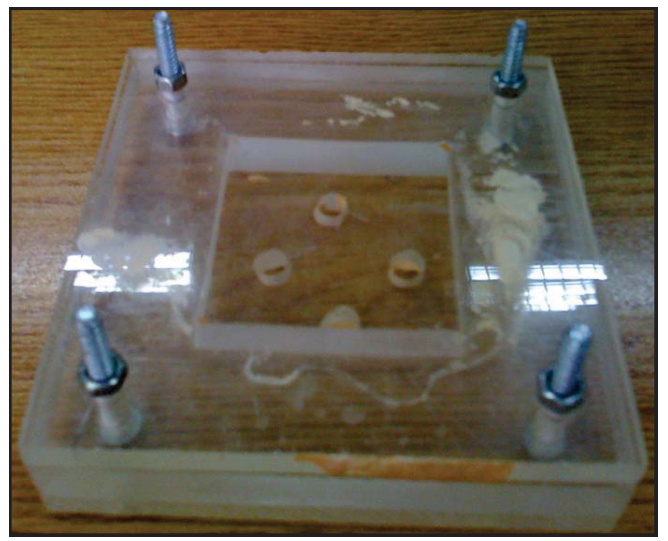
FIGURE II: ABRASION TESTING MACHINE, THE SPECIMEN IS BEING TESTED