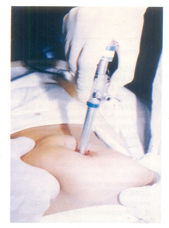
Figure IV: The trocar of cannula is pulled up so as to prevent injury of the visceras