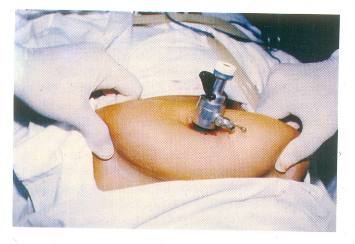
Figure V: Remove the trocar, now push the cannula entirely inside the peritoneal cavity (till now the anterior abdominal wall is pulled up). Now connect with insufflator